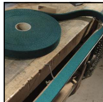
New cloth being installed

The cause for the hammer rail cloth to deteriorate is either simple wear and tear, or the destructive action of moths and other felt eating insects over the years. When the felt becomes worn, as in the photo above, the hammers are not caught at a consistent distance. Also, the action may be noisier, as the cushioning power of the felt is decreased.