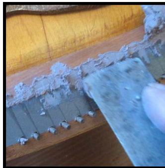
Split-out holes are filled.

Fortunately, when the splitting is not too severe, an on-the-spot remedy is often possible by the use of a heavy paste epoxy to fill in the damaged area. Oftentimes, if enough time is allowed for, this repair may be made on the same day that the piano is tuned. The bass bridge pins of your piano are loose to the point where it is affecting the tone of the piano. To make epoxy repairs to the bass bridge of your piano, extra time will need to be scheduled ahead of your tuning appointment.