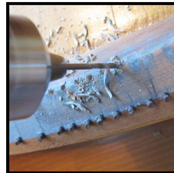
New holes are drilled.

With the bass strings temporarily removed from the bridge and bundled out of the way, the loose bridge pins will be pulled out completely so that the epoxy filler may be used. This epoxy cures rapidly as a result of the chemical reaction to the two components that are mixed together on the spot. Within a short amount of time, the hardened epoxy is ready to sand and drill for the reinsertion of the bridge pins.