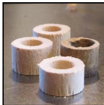
New and old bushings.