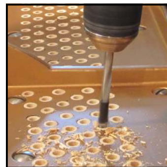
Reaming for tuning pins.