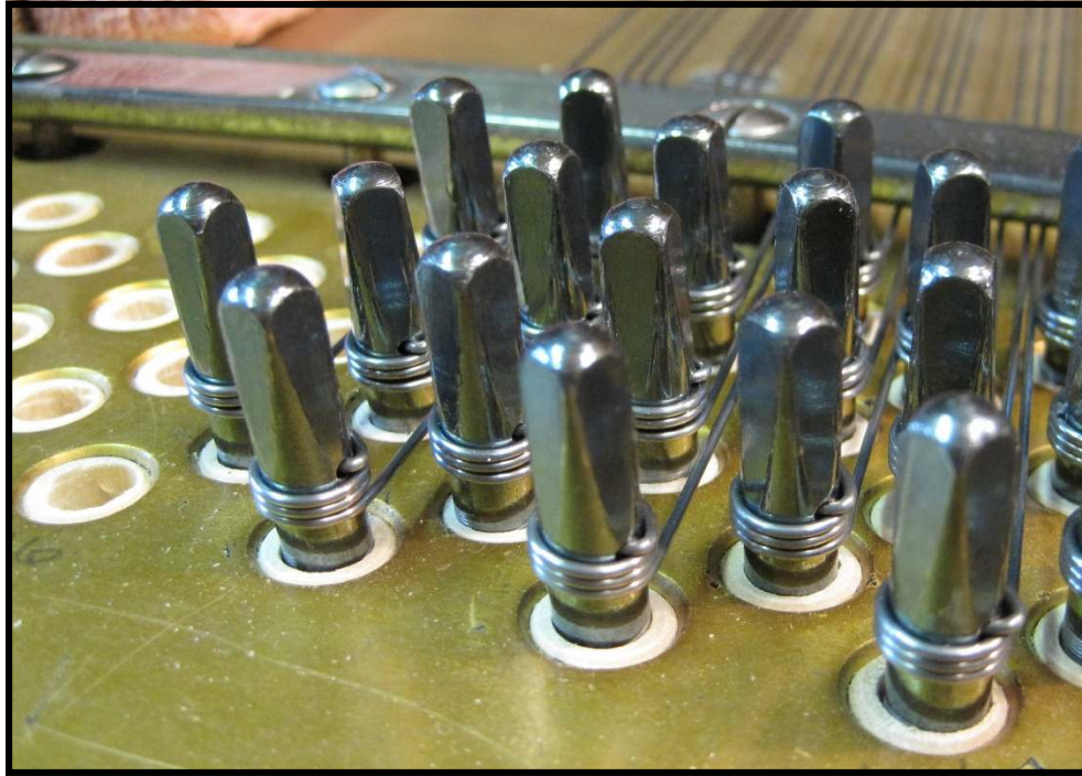
New tuning pins and strings being installed.

For a piano to maintain a stable tuning and sound its best, it is essential that the tuning pins are tight and that the strings are in good condition. When the tuning pins of a piano become loose and tend to slip, the piano will not stay in tune for a reasonable amount of time. When the strings have deteriorated to the point where they are breaking frequently, the tone of the piano will usually suffer as well. Your piano is showing symptoms of problems caused by brittle strings and loose pins which could be lessened or eliminated if your piano were to be repinned and restrung.