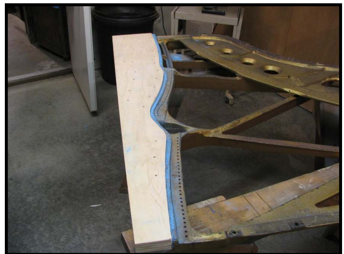
Underside of cast iron plate with new pinblock installed.

Because of the nature of the work involved with this procedure, it would be necessary for the piano to be transported to the workshop.